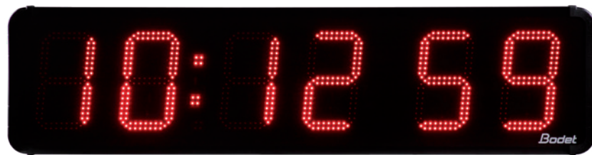
HMS: Hour - Minute - Second